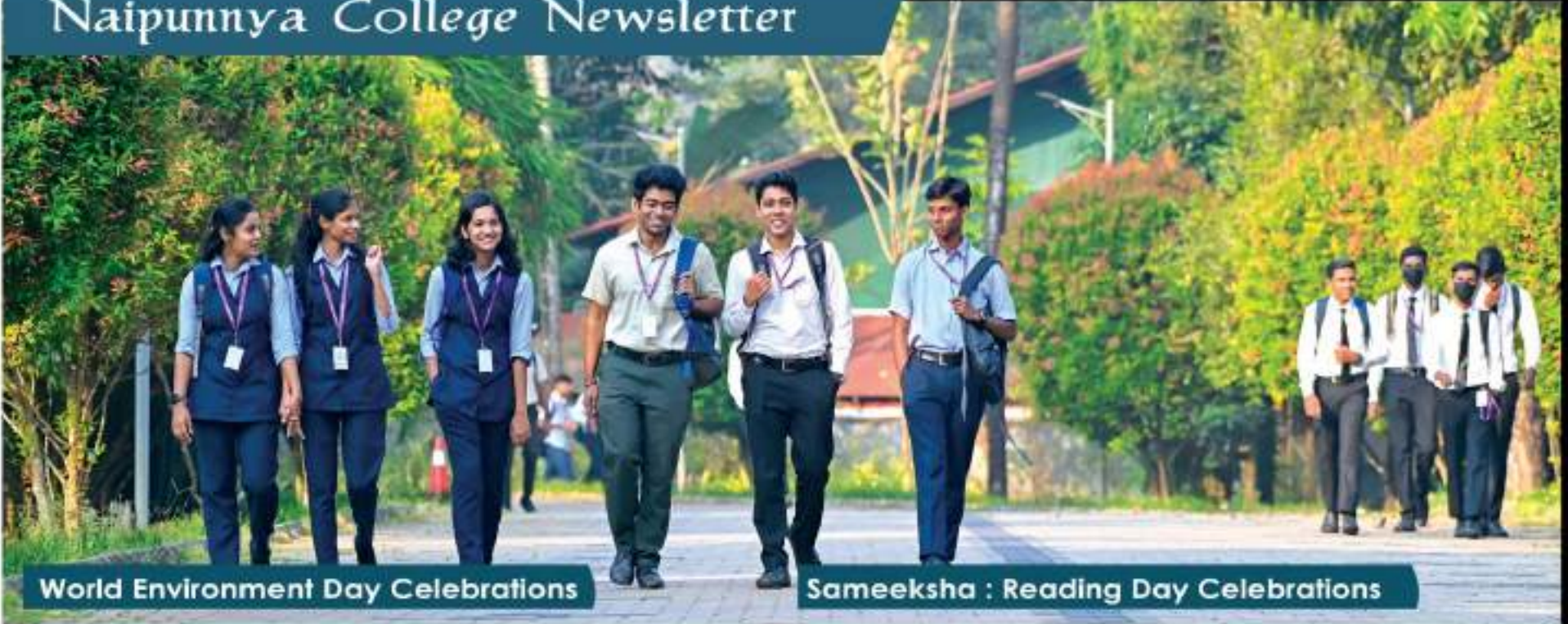
World Environment Day Celebrations