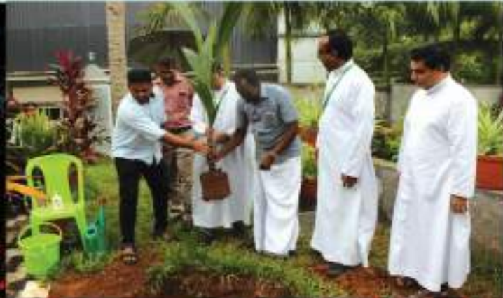
World Food Safety Day